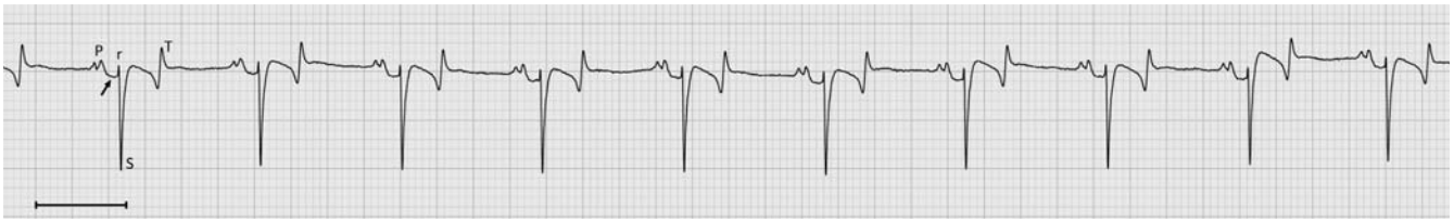
Figure 1. Normal sinus rhythm with P wave, QRS complex and T wave. The arrow indicates T_a wave, the line bar indicates 1 second.